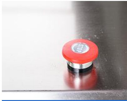
EMERGENCY "STOP" BUTTON

power with the fuse and with a master switch and also with battery, it needs to be pressed when using.