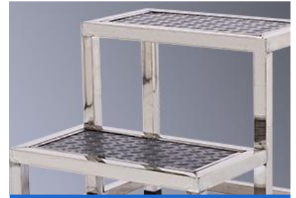
Human Nature Design

Equipped with rubber-coated legs, these foot pedals offer enhanced anti-slip properties, ensuring a stable and secure footing, making it a reliable choice.