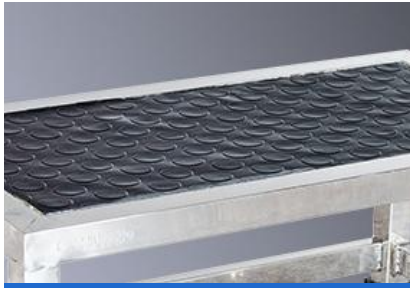
Non-skid Ribbed Platform

The surface of the foot pedals features a threaded design with uneven patterns, providing an anti-slip function. Preventing slipping or accidents, making it safe and reliable for use in various environments.