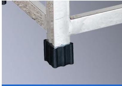
Reinforced Rubber Feet

The surface of the foot pedals features a threaded design with uneven patterns, providing an anti-slip function. Preventing slipping or accidents, making it safe and reliable for use in various environments.