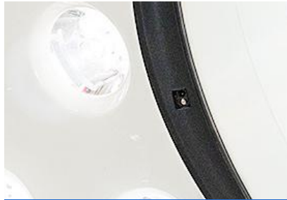
Sensing adjustment brightness

Powered by long-lasting LED bulbs, ensures an extended lifespan and minimal heat emission. Experience efficiency and durability.