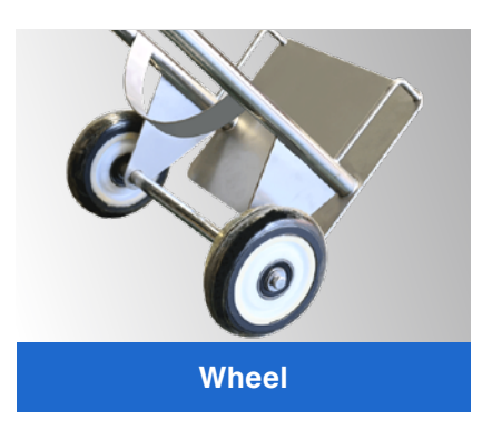
The base is equipped with large casters, which allows for flexible movement and saves energy.

U type design, suitable for oxygen cylinder.