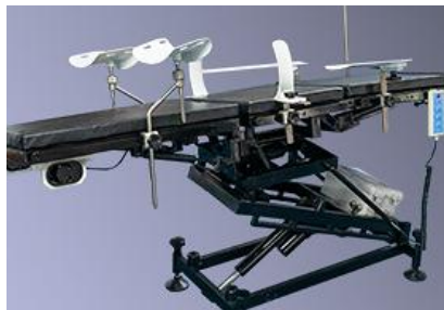
Left and right tilt

Ground depth adjustment range can be adjusted via 4 pcs support holder.