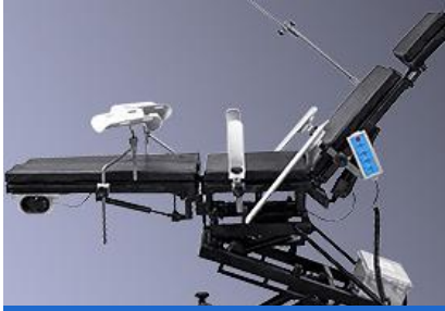
Back board adjustment

Back board can be adjusted through hand remote controller from -18 to +82 degree.