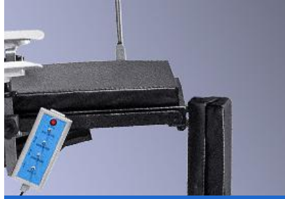
Head board adjustment

Back board can be adjusted through hand remote controller from -18 to +82 degree.