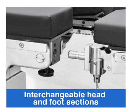
Modular design allows interchangeable heads and feet.

The hand remote control has LCD display. When you press a button, the corresponding icon will be displayed on the LCD display.