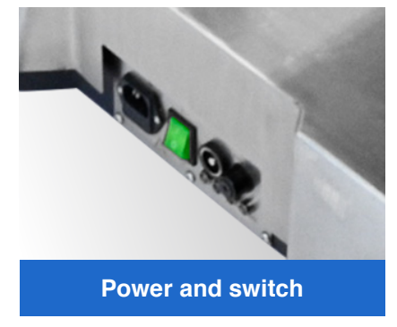
Control power, the motor will not work when turned off.