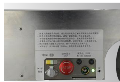
Emergency stop button

It acts as a mirror, allowing medical staff to effectively observe the patient's condition.