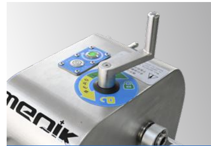
Switch button and lock

The bracket can be manually rotated 360° when unlocked, and it will be fixed and cannot rotate when locked.