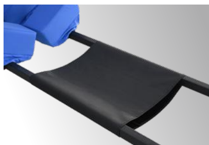
Carbon fiber frame

Two carbon fiber tubes form the operating table, and the hollow design can be used well with the C-arm.