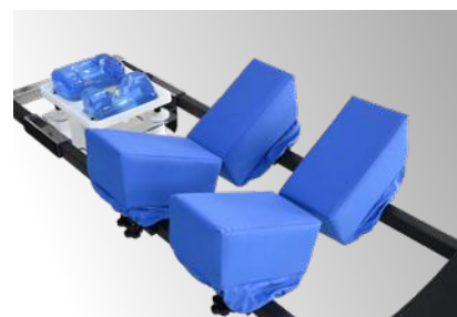
Spinal surgery accessories

When encountering an emergency, you can press the emergency stop button.