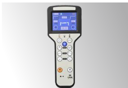
Hand remote control

There is switch button and lock on the top of one side column of the operating table. The operating table can only be operated when the light is on and locked, otherwise it will not be able to be operated.