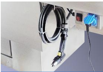
Spray Water Gun

There is a crusher under the pool that can be used to process and remove waste.