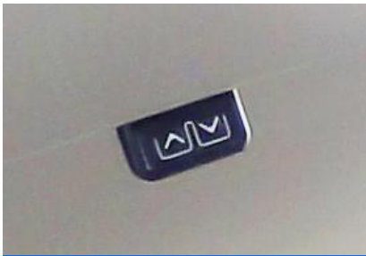
Height Adjustment Button

Equipped with 2 water taps, one tap can provide hot and cold water, and the other can flush formalin liquid.