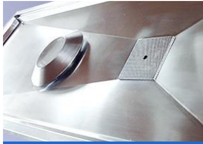
Inclined Downward Table

with 3 removable Grid Plates. Liquids and small objects may flow into the bottom through the holes.