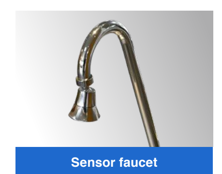
Induction water, water temperature can be adjusted freely.