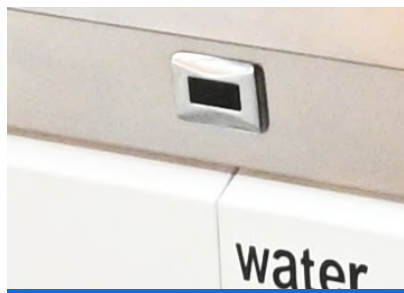
Knee control design

Induction water, water temperature can be adjusted freely.