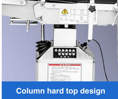
Column hard top design

The base is in contact with the ground over a large area and has an extreme stability. Meanwhile, the surgeon get more access to the patient with flat base. Moreover, the movement space of the C-arm is increased, which increases the operation space of the C-arm specially for those big machine.