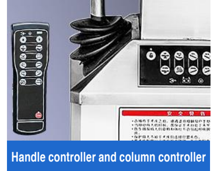
Handle controller and column controller

Hard top design, no wrinkles, to avoid trapping dirt and easy for disinfection.